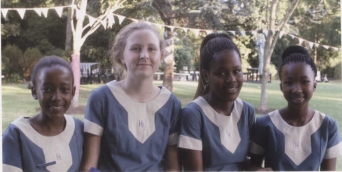
Our Grade 8 boarders in their first week in Arderne House.