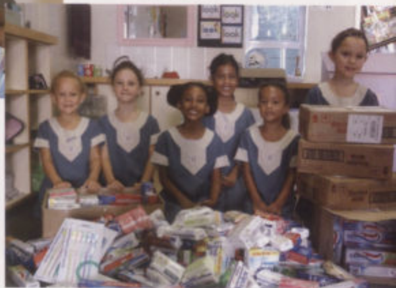
The girls at the Preparatory School donated a mountain of soap and toothpaste for the homeless and for love packs which will be distributed at the Mowbray Maternity Home.