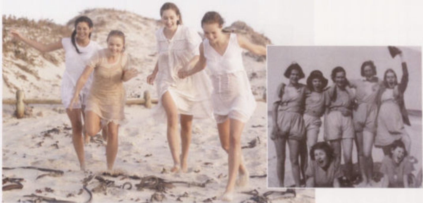
Dèjà vu. The cast of My Mother Said I Never Should on Muizenberg beach for a poster photo shoot (above, left) and a photograph of Herschel girls on Muizenberg beach, circa 1930 (above, right).